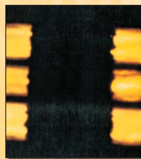
Excellent backlight performance 絕佳的背光表現